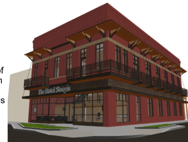
Conceptual drawings show the addition of balconies and windows facing Main Street.

The remodeling will begin in December. The Hotel Sturgis is scheduled to open in May 2019.